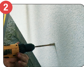
2 Drill a 16mm hole through the render and insulation until the original substrate is reached.