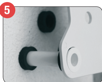
5 Place the neoprene washer onto tube and insert into wall. Additional washers are supplied for any cable penetrations required.