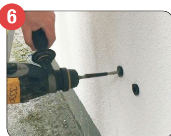
6 Drill through tube into substrate to the appropriate depth for fixing (site specific).