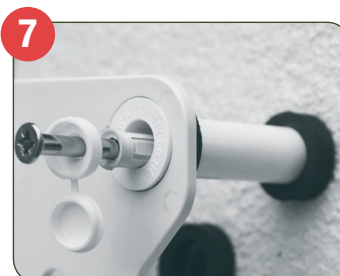
7 Insert plug and attach fixing cap.