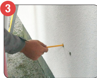
3 Insert tube, or measure depth of hole from finished render back to the original substrate, making an allowance of 4mm to allow the neoprene washer to compress and provide a seal when installed.