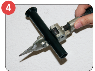
4 Cut tube to length using pipe cutter or hacksaw.